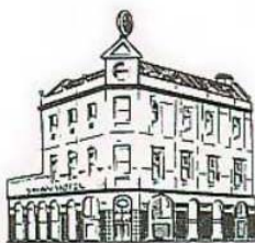
THE SWAN HOTEL

To hopefully celebrate another State League Premiership (or two), the Club is holding a function at the Swan Hotel in Richmond on Thursday 27 March 2003, immediately following the completion of the second day of the State League Finals (from about 9:30 pm onwards). After supporting both our teams at Olympic Park in the finals, please join us afterwards at the Swan Hotel to help celebrate another successful season.