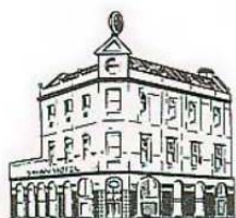
THE SWAN HOTEL