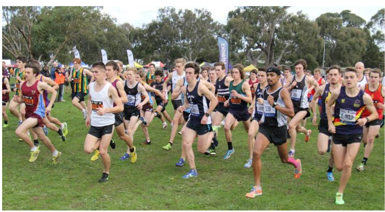
Presented at the Annual General Meeting of the Box Hill Athletic Club Incorporated, held at Hagenauer Reserve, Barwon Street, Box Hill on Friday 1 May 2015