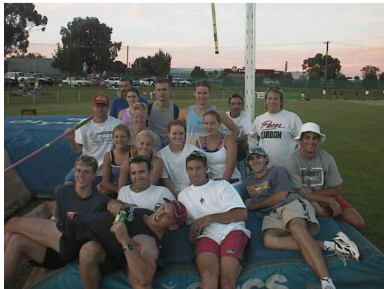
All the vaulters from Temora. The guy in the blue t-shirt bottom left is the one who was handicapped on 2.00m.

The athletes from Temora 2000 will never forget their weekend away from Melbourne and I doubt that Temora will ever be the same again... at least not until next year.