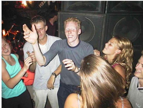
The pole vaulters partying hard at the Westminster.

The athletes from Temora 2000 will never forget their weekend away from Melbourne and I doubt that Temora will ever be the same again... at least not until next year.