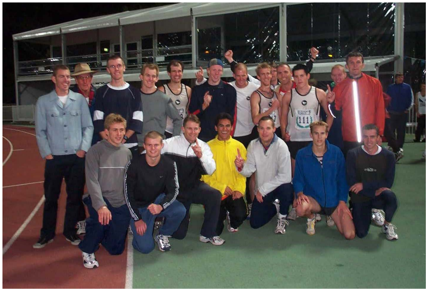
Winning Team - Men's State League Finals 2002