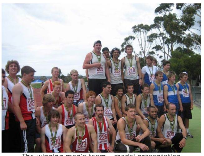
The winning men's team - medal presentation