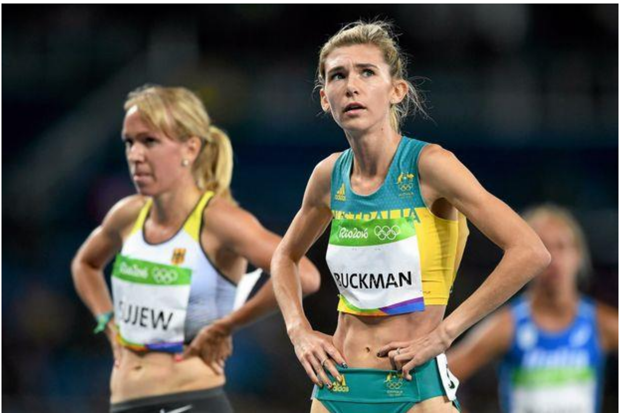
Zoe Buckman represented Australia with distinction at the Olympic Games in Rio de Janeiro