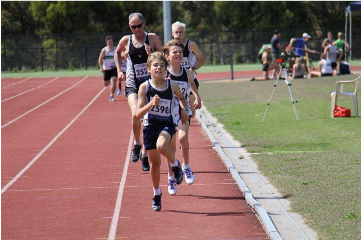
Box Hill men's teams won premierships from under 14 up to over 40s