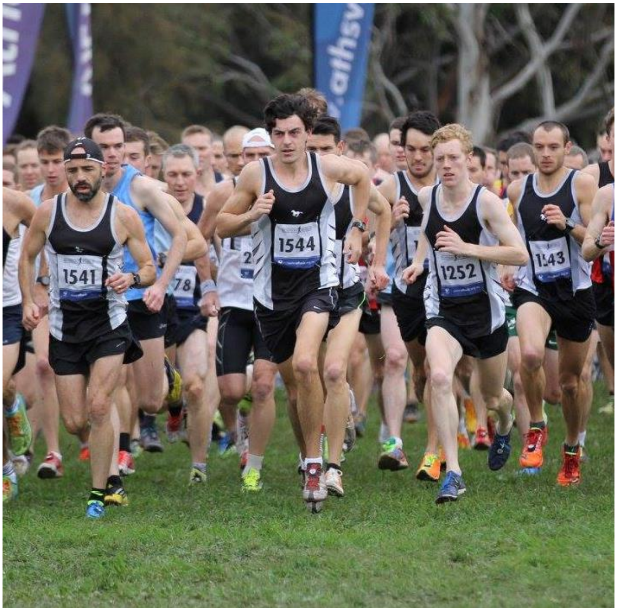
The start of the Bundoora Park cross country championships