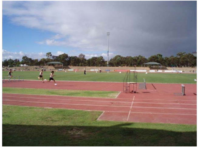
Mohamad Zeed wins the 200 m hurdles