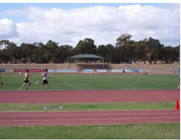
Andrew Nagel - 800 m