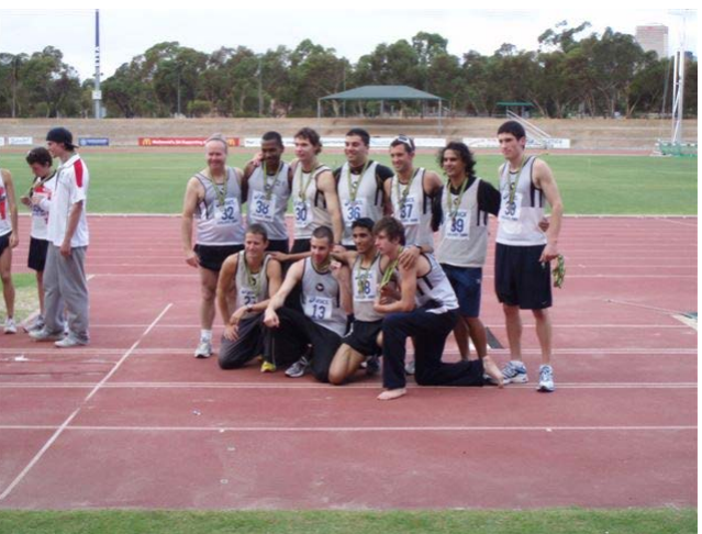
The men's team with their silver medals