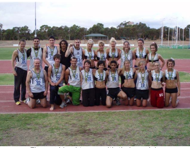
The combined teams with their medals